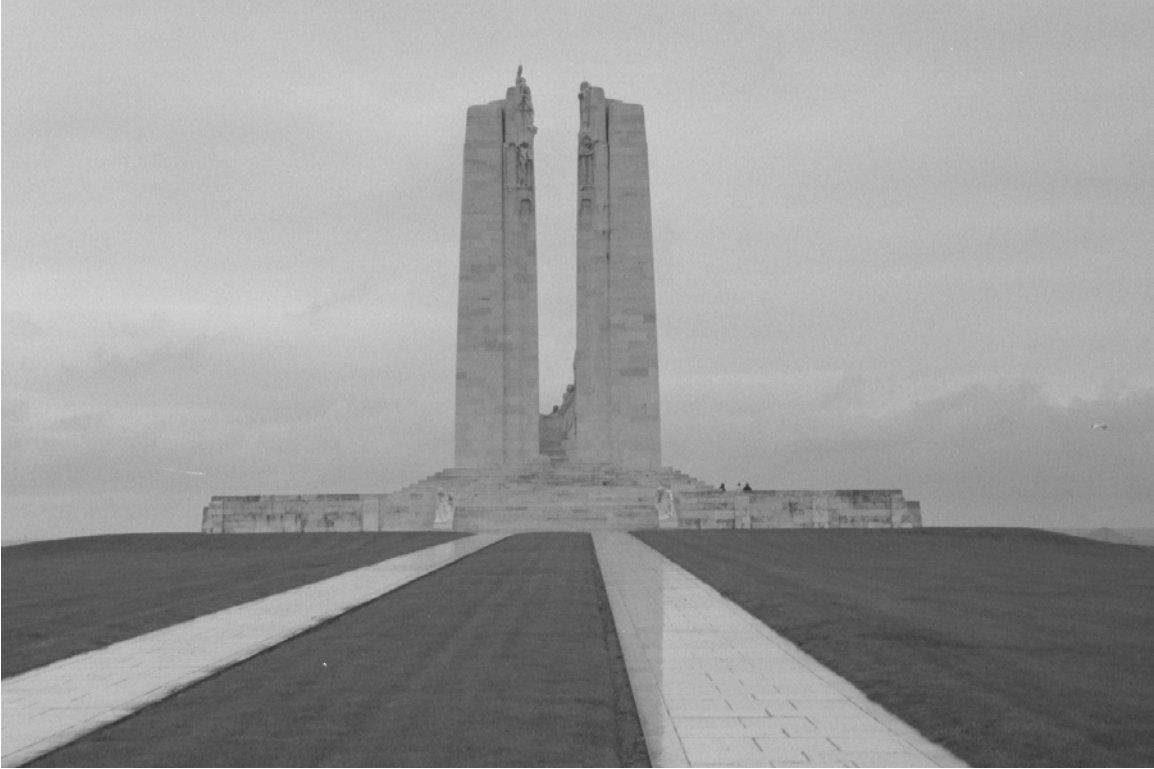
Vimy Memorial, view from the road (looking eastwards)