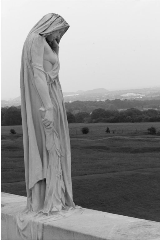
Canada mourning (looking down on tomb)