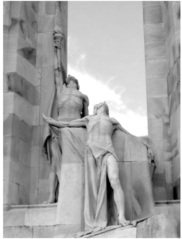
In between the pylons, a torch is