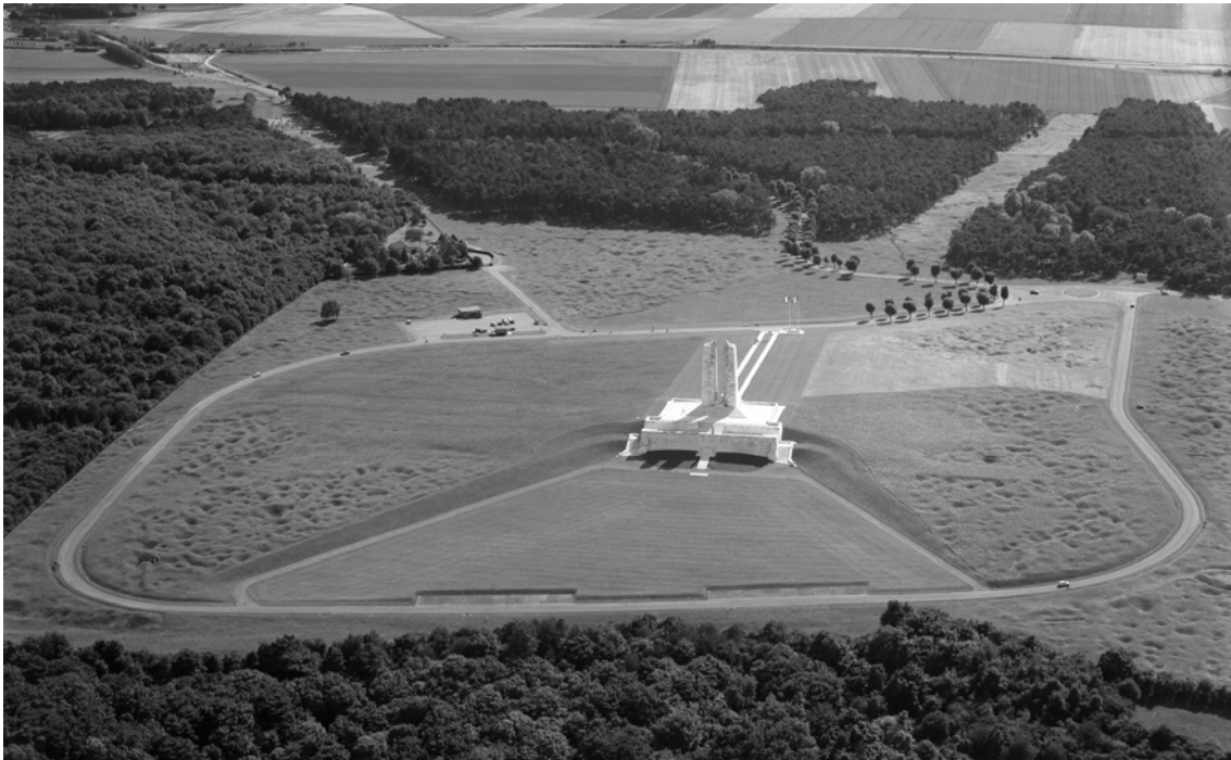
Looking westwards at the Vimy Memorial