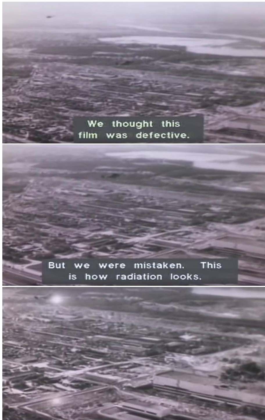
Figure 9: Vladimir Shevchenko, stills from "Chernobyl: Chronicle of Difficult Weeks," 1986.