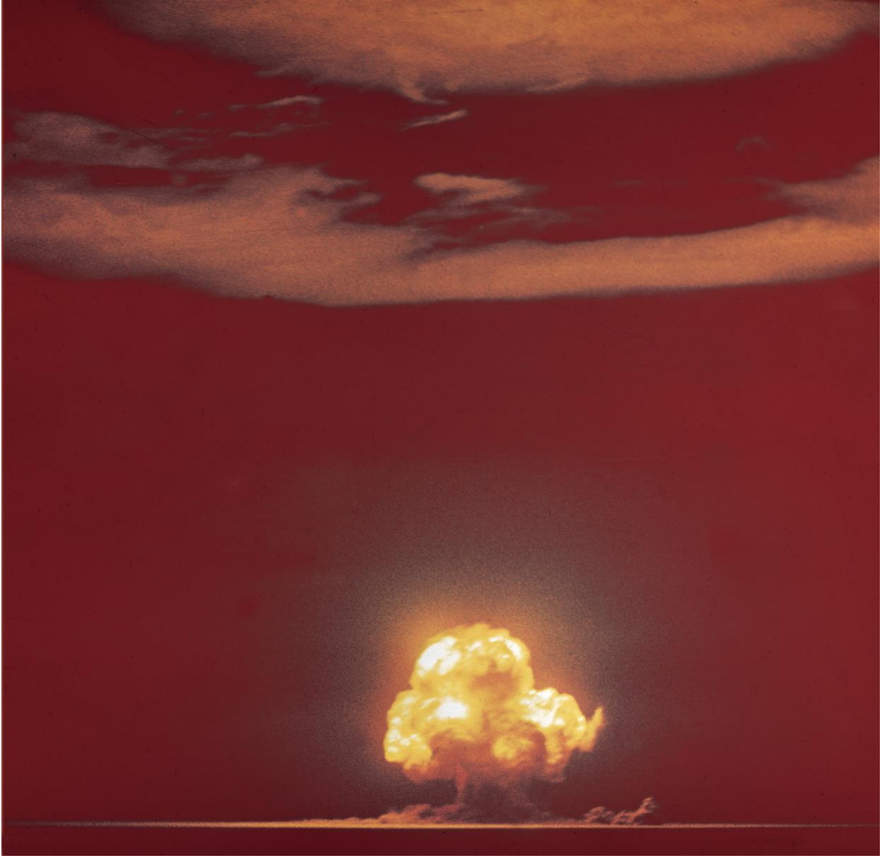
Figure 6: Jack Aeby, "Trinity Atomic Test, New Mexico," July 16, 1945. Yield: 20 kT.