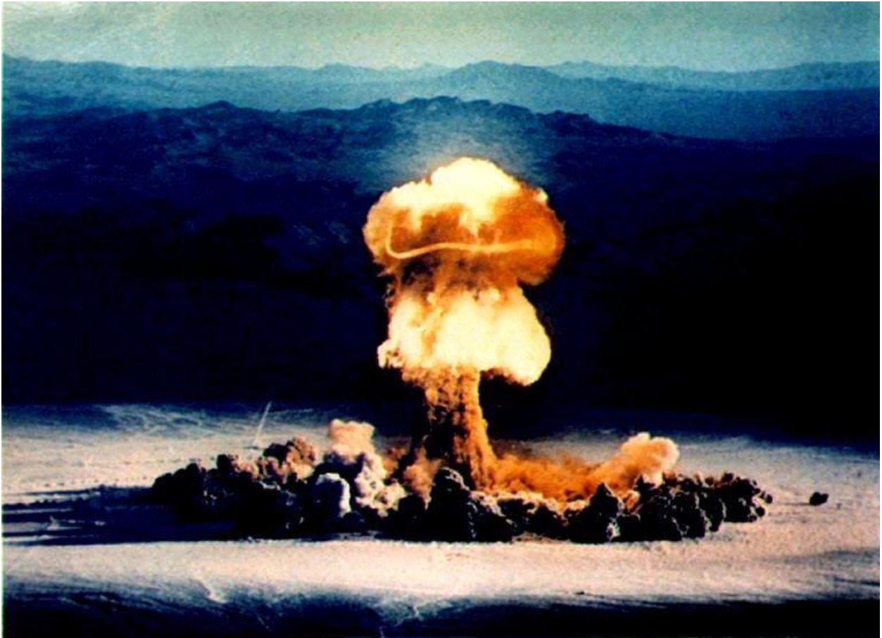
Figure 1: Grable Atomic Test, Nevada Test Site (May 25, 1953). Yield: 15 kT.