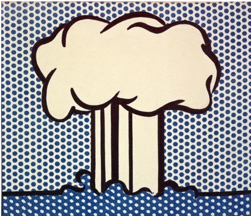
Figure 5: Roy Lichtenstein, "Atomic Landscape," 1966. Oil and acrylic on canvas. Private collection.