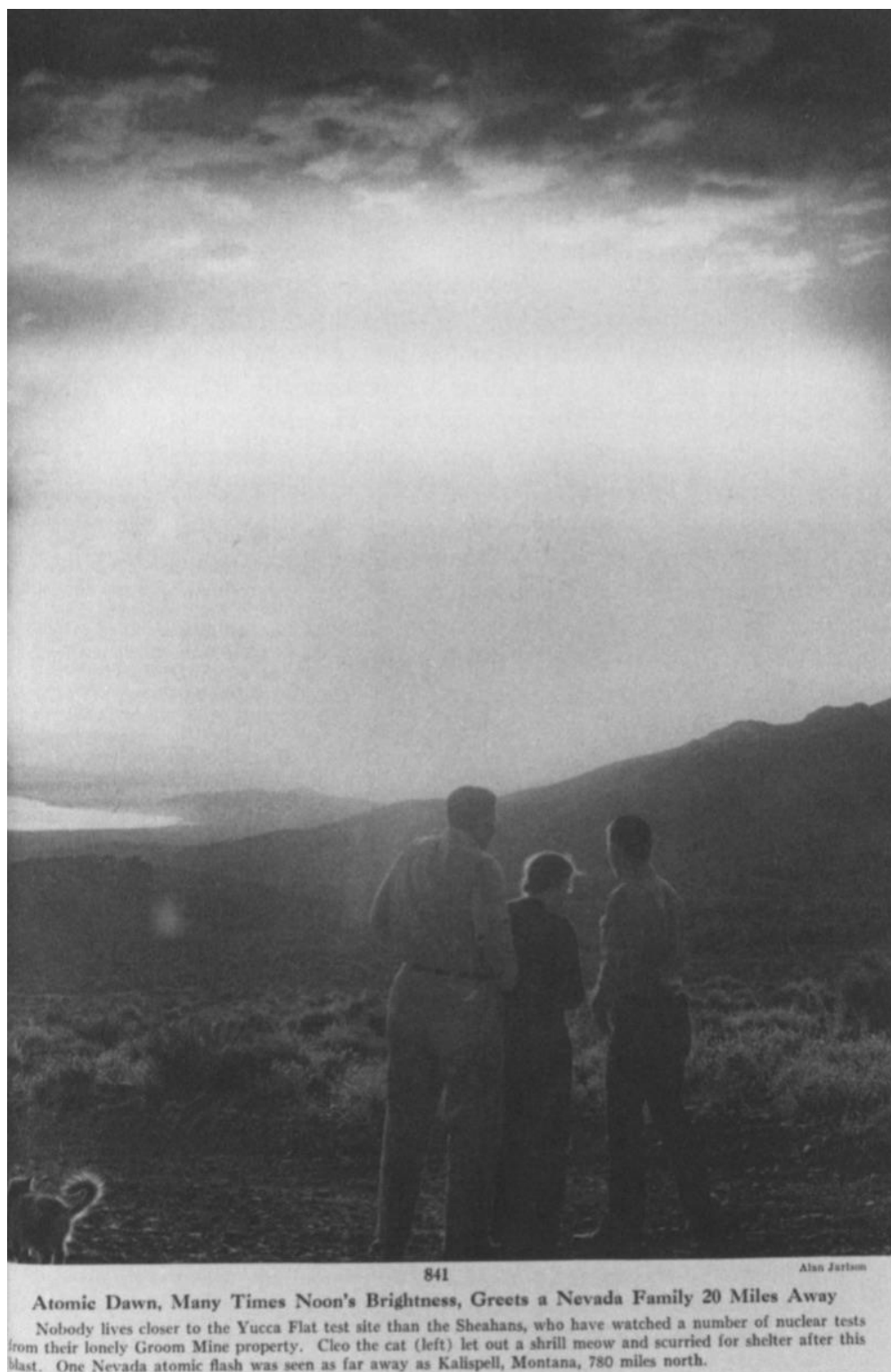
Figure 3: Alan Jarlson, "Atomic Dawn, Many Times Noon's Brightness, Greets a Nevada Family 20 Miles Away." National Geographic (1953).