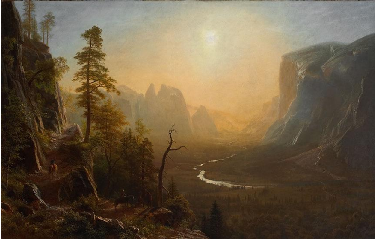
Figure 4: Albert Bierstadt, "Yosemite Valley, Glacier Point Trail," ca. 1873. Oil on canvas, 137 x 215 cm. Yale University Art Gallery (1931.389).