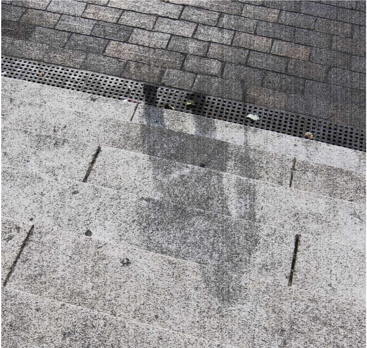
Figure 10: Atomic shadow, scorched into the concrete of Hiroshima.