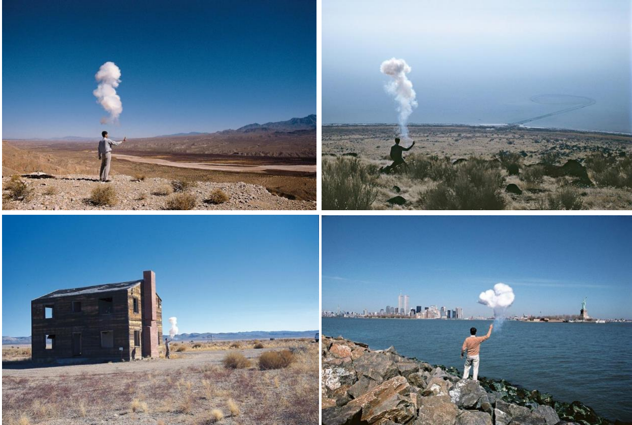
Figure 13: Cai Guo-Qiang, "The Century with Mushroom Clouds: Project for the 20th Century," 1996. Explosion event, dimensions and locations variable. Locations of selected photographs (counterclockwise from top left): Nevada Test Site; Nevada Test Site; New York, NY; Robert Smithson's "Spiral Jetty," Salt Lake, Utah.